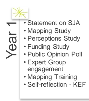
Figure 1: Summary of Implementation Plan activities

Self-reflection - KEF Expert Stakeholder Engagement Capacity Framework Evaluation Framework