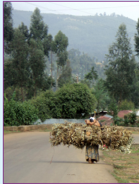
Woman carrying fuel wood, outskirts of Addis Ababa, Ethiopia (2011)

The M&E team collects and reviews this data and shares it with Bioeconomy Africa management to review progress and potential gaps in services or information. Data is also shared with the farmers in order to keep them updated and discuss how the project can improve. “We get their opinion about why the gap is created. They will tell you all the reasons and what they think the solutions are. Wherever there’s a gap, we try to address it. What solutions are there to fill the gaps? Do we have to go to other stakeholders or organizations? The government?” They also visit the local government offices and share the information learned through M&E, or facilitate discussions between community members and local government officials so they can directly convey their concerns. “We tell them about any problems we are having, and ask for help filling gaps.” The M&E lens is also turned inwards. “We also monitor ourselves on our advocacy work. Did it make any impact? We use