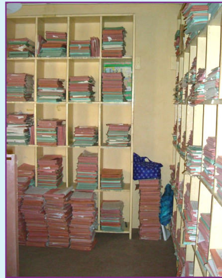
Records room at a community-based reproductive health clinic, northern Nigeria (2008). The shelves hold client records, which were transcribed into notebooks and then to forms for reporting to donors.

Advocates are also feeling the pressure to demonstrate quantifiable impact as the broader development discussion around results and value for aid dollars influences the way donors and project managers talk about results. “Advocacy needs to shift from emotional to economic. We need to show the value we’re getting for the advocacy money and learn from ‘results-based financing’” (Anonymous, 2011a). There is pressure to engage in the type of randomized evaluations undertaken by the Abdul Latif Jameel Poverty Action Lab (J-PAL),